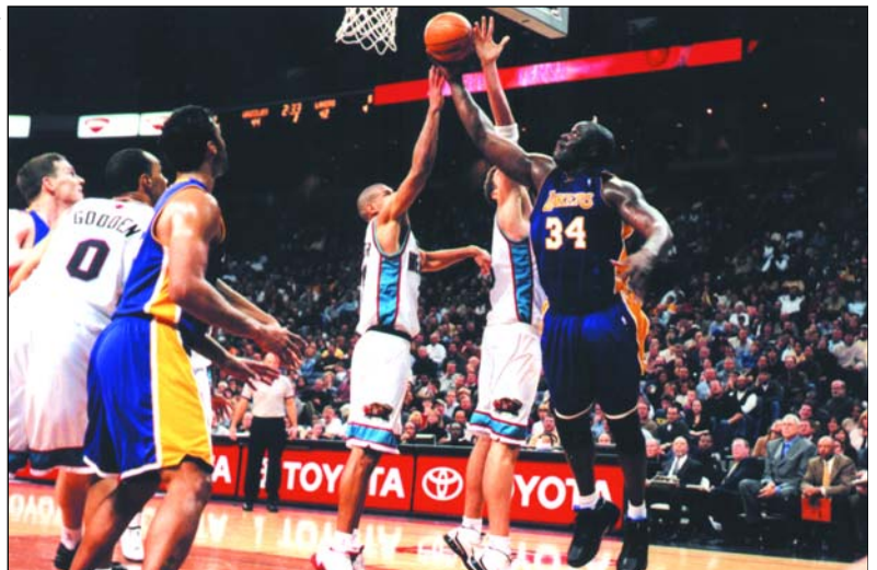
LOS ANGELES LAKERS' SHAQUILLE O'NEAL TAKES THE REBOUND FROM MEMPHIS GRIZZLIES' SHANE BATTIER IN THE NBA GAME AT THE PYRAMID ARENA IN MEMPHIS.

I owe it all to the Gold Press Program and IFPO. I am confident now that I can cover the kind of events in the future that I had only dreamed about in the past. Ω